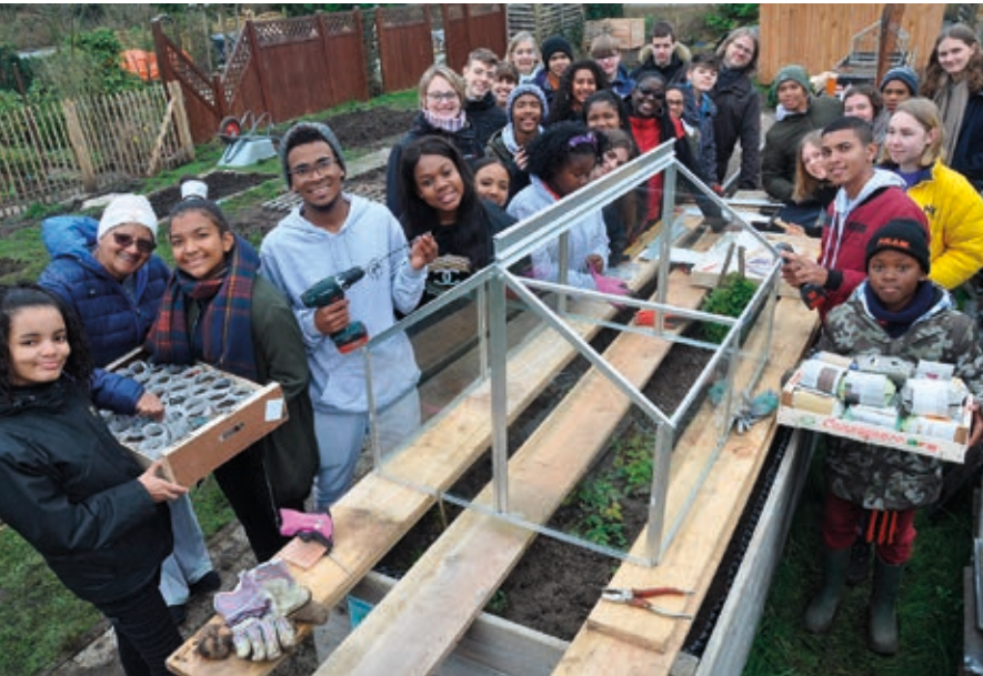
The school garden in Oldenburg