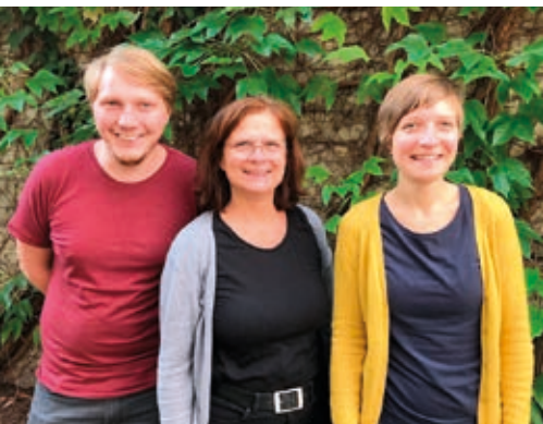
The editorial team

What makes global education dialogue so important right now?