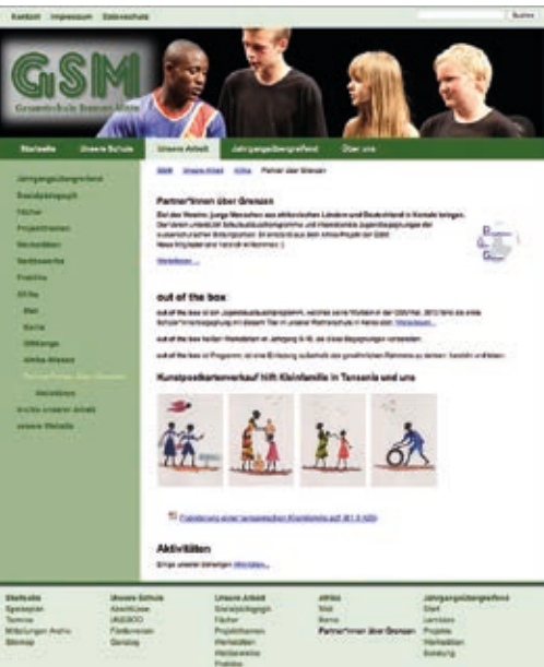
Website of the Gesamtschule Bremen Mitte, Germany, with information about its partnership with an association in Nairobi, Kenya

Does the school, association or organisation have a website? In addition to important information about the project and its sponsors, the website should also include testimonials. Or perhaps some of the participants have their own blog where they would like to publish their experiences? Using the free Wordpress tool, it is also possible to quickly create a website for the project. This would allow the reports of both partner organisations to be published on the same platform. In the case of joint websites, it should always be clearly indicated who the authors of the individual texts are. It is also important that the articles are properly structured. Each text should cover only one topic, otherwise it will be too long, and its various aspects can be clarified by means of subheadings. Websites offer plenty of space for images, which can be compiled in a photo gallery, for example. Or perhaps short videos have been created that could also be uploaded?