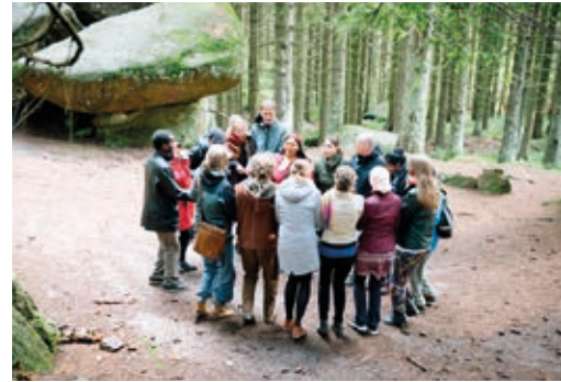
Outdoor group work on sustainability