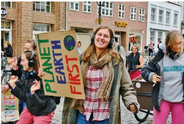
At Silent Climate Parades, demonstrators dance to music broadcast via headphones, with the aim of raising awareness about climate change

Transformative education is not only about acquiring additional knowledge, but at least as much about questioning our existing knowledge and view of the world – in other words, it is sometimes concerned with unlearning certain patterns of thought, meaning and behaviour that stand in the way of transformation. It is about a critical and emancipatory education that enables people to break free from the narrow intellectual and emotional shackles that have been imposed on them in the course of their socialisation. It is about a participatory education that creates spaces for experimentation instead of defining educational content. It is about a loving education that values talent and diversity in a radical manner while strengthening people’s curiosity and enjoyment in learning and acting together – beyond normative pressures to perform. It is about building global relationships, forming powerful bonds of empathy and creating connections.