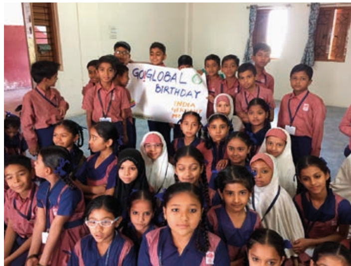
The pupils from the FD Primary School in Ahmedabad