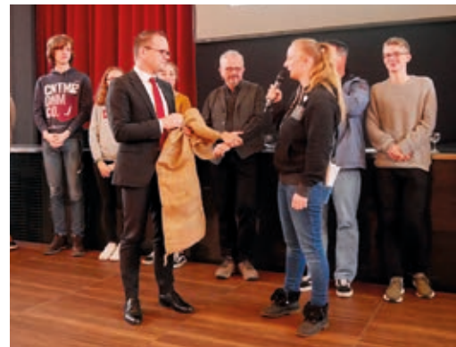
Peer leaders submit proposals for how to improve the school system to the Minister of Education of the German state of Lower Saxony