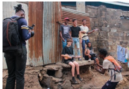
Shooting of a music video in Nairobi, Mathare. Music and text created during the Youth Exchange 2019.