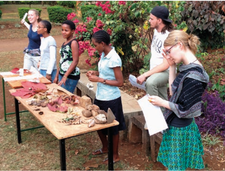
Table theatre adaptation of the German children's book "Frederick"