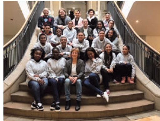
South African guests in Germany 2019

www.willowacademy.co.za/ www.t1p.de/partnerschaft-schafft-energie www.sanctorhigh.co.za