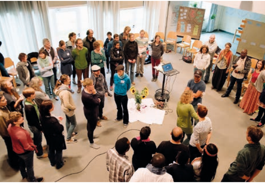
Network members connecting at a conference in 2017