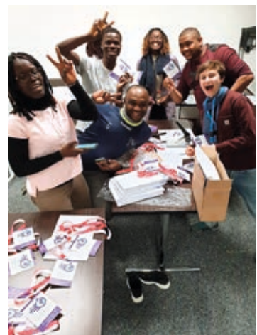
IYC members preparing welcome package for the conference

The Respect Guide can be downloaded for free in English, French, German: http://www.i-paed-berlin.de/de/Downloads/