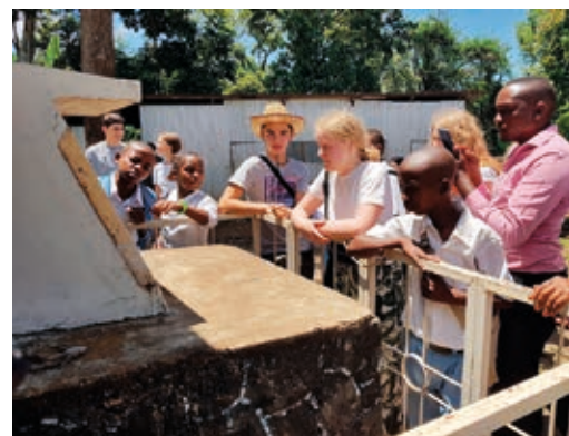
Visit to a monument commemorating Christian missionaries