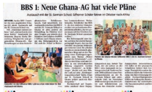
Newspaper article about the partnership between Vocational School No. 1 in Giffhorn, Germany and the St. Germain School in Agona Swedru, Ghana