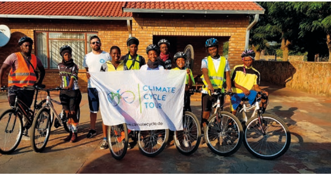
Die Climate Cycle Tour in Südafrika