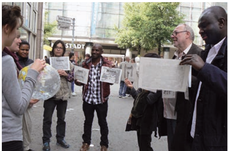
Global learning methods convey global relationships and can also be used well during visits.