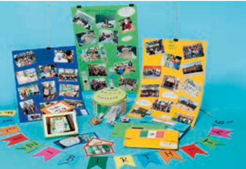
Posters created by the pupils of the Schule am Wingster Wald, Germany