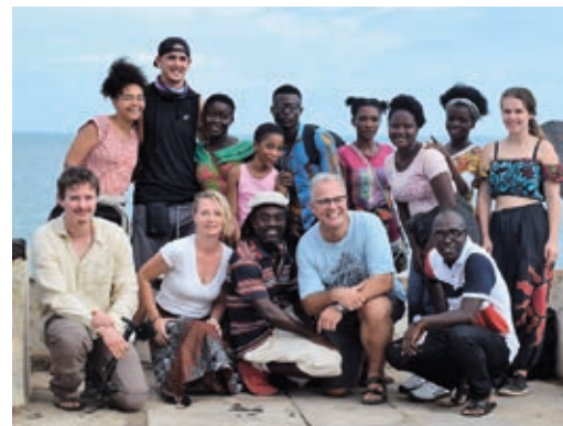
Our encounter in Ghana 2018