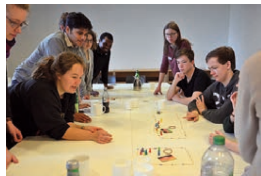
Educational activity in Germany