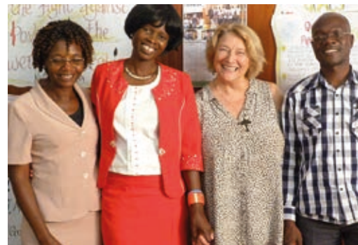
Coordinators of the Partnership between Blantyre and Hannover

In the Blantyre schools, students try to contribute to an environmentally sustainable world through annual tree planting drives and by raising awareness about how to properly dispose of school and domestic waste. At school level, we are trying to tackle the problem of plastics pollution by promoting good practices for reducing, reusing and recycling waste. The aim of aware&fair Hannover is to network the partnership activities in other countries, for example in Colombia. Based on the example of Blantyre, we would also like to establish aware&fair clubs in schools in Hannover. Our collective plans for the future are many and varied. We need continuity and consistency and strive to build more partnerships to exchange good practices in education for sustainable development and environmental protection in order to create a more just and fair world.