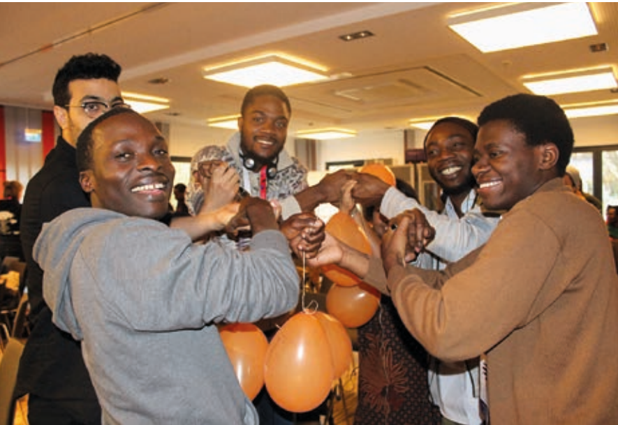
Participants of the conference are networking