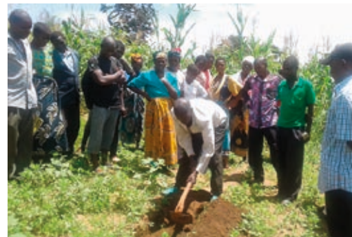
Farmer training in Malawi