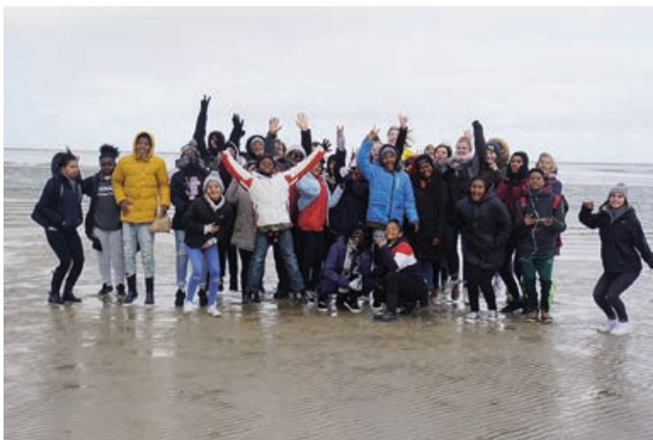
Students of the Willow Academy in Port Elizabeth, South Africa, and the Helene-Lange-Schule in Oldenburg, Germany, on an excursion to the Wadden Sea (Germany)

Former student at the St. Germain School, Ghana