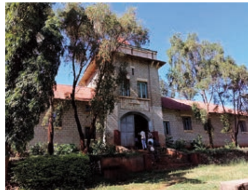
Military barracks from the colonial era

www.facebook.com/msituwatembo www.t1p.de/helene-lange-schule