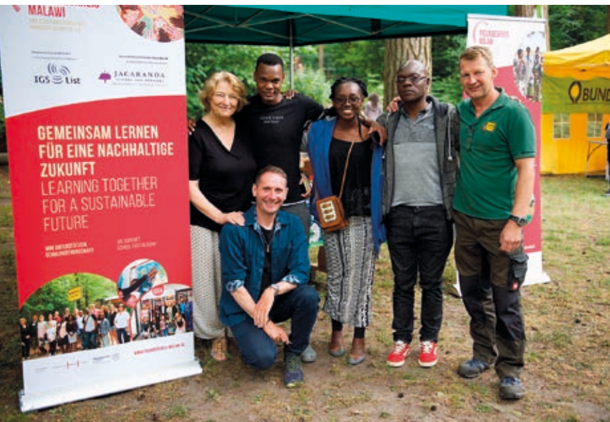
Partners from Blantyre and Hannover present their work.