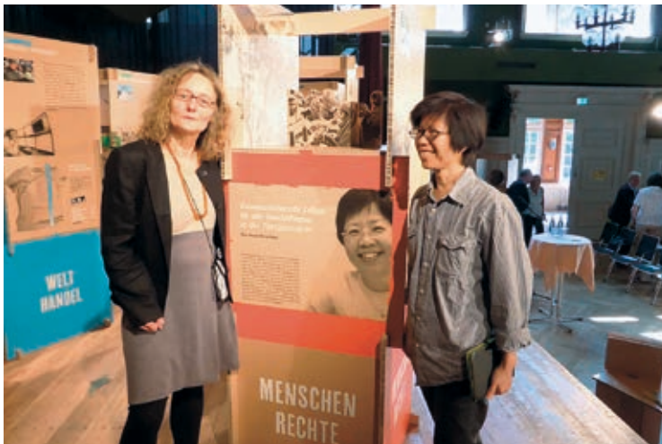
Exhibitions are one of the concrete products that can emerge from global educational partnerships