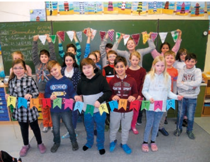
The pupils from the Wingster Wald primary school