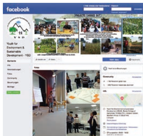
Facebook page of Youth for Environment and Sustainable Development (YSD) from Lilongwe, Malawi, with photos from the “Connect for Change” conference

If no direct links to media representatives exist, a press release can help to make the educational partnership known to the public. Since journalists receive a lot of information every day, it is important to explain to them right from the start why this information or report should be published in a newspaper, on the radio or on television. The easier it is for the journalist to process the press release, the better, bringing you one step closer to getting it published. To this end, the “W” questions need to be considered, starting with the most important one. Quotes from the people involved are particularly significant in this respect. A good photo also increases the chance of being featured in a newspaper, for example. It is important to provide a contact person including a telephone number for possible questions. The press release should be sent by email with the photos attached. The contact details can be found in the publisher’s imprint inside the newspaper or on the websites of the media outlets in question.