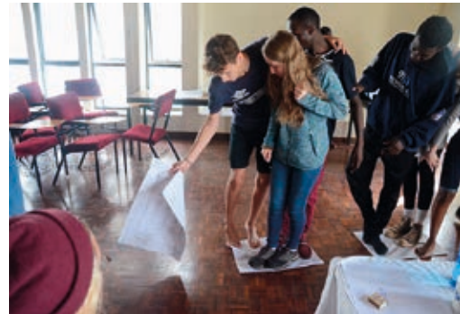
Teambuilding during the Youth Exchange 2019

www.partner-ueber-grenzen.de/ www.myffworldwide.weebly.com/