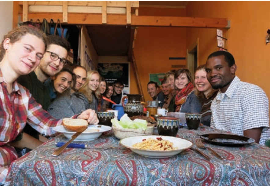
Climate brunch in Lüneburg