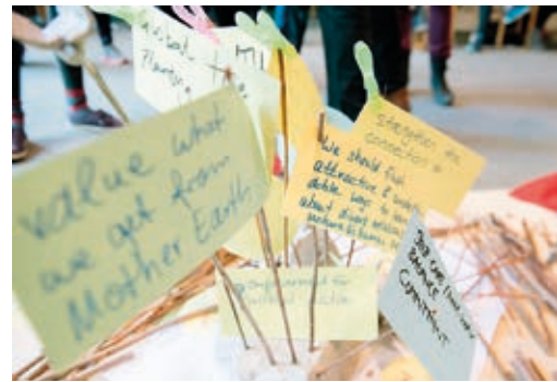
"Living a good life", "the rights of Mother Earth" and "sustainability" – the guiding themes of the network