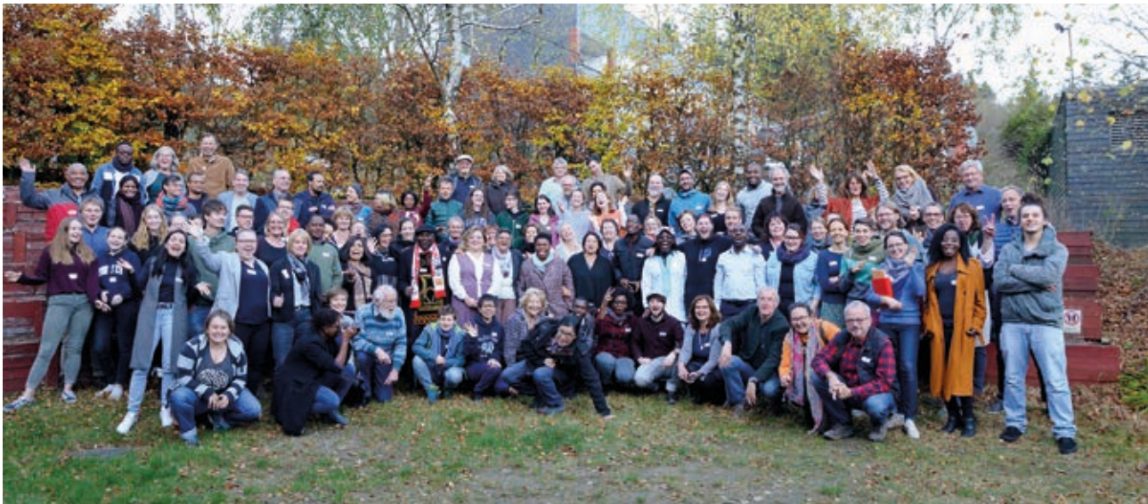
Group photo: Organizers and participants of the “Connect for Change” conference in autumn 2019

Lines from a song created during the “Connect for Change” conference